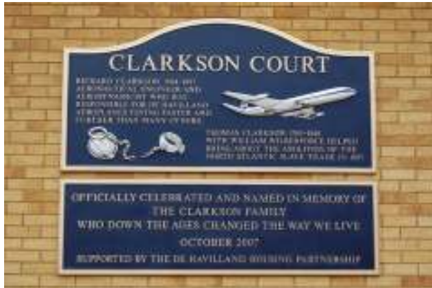
Comet 4 and other de Havilland aircraft.